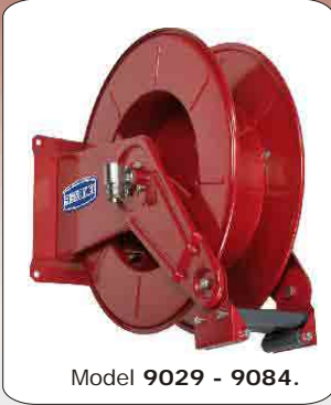
Model 9029 - 9084.

Spring retractable open style hose reels with twin pedestals and fully adjustable arms and roller assembly. These hose reels have powder coated finish. They can be supplied as bare (no hose) or fitted with hose. They are compatible with diesel, air and water at low pressure.