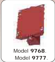
Model 9768. Model 9777.

These hose reels are also available in 304 grade stainless steel. Code numbers for these are 9527 and 9534.